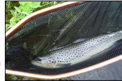
A Millers River Brown Trout