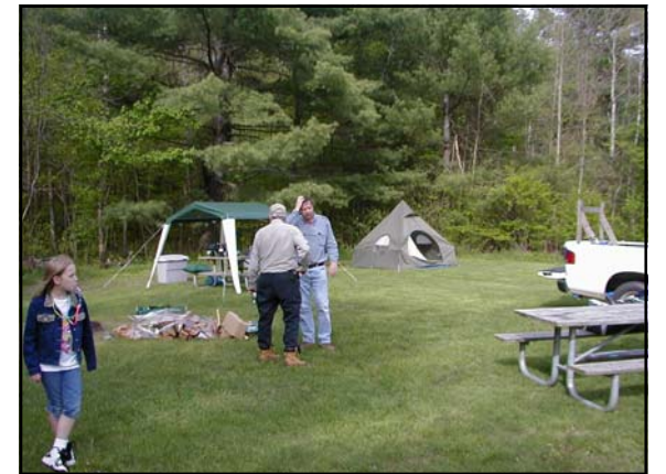
Campsite at Indian Hollow

The Westfield River offers some of Massachusetts' best trout fishing. The area adjacent to the campground is designated “Catch and Release” and usually gets a healthy stocking by MDFW just prior to the event. The campground is also located at the south end of the stunning Chesterfield Gorge known for its scenic hiking trails. Visit http://www.thetrustees.org/pages/291_chesterfield_gorge.cfm for more information on the gorge area. Driving directions and more information on the Council's fishing weekend and can be found at http://www.ma-ri-tu-council.org/Indian-Hollow.html .